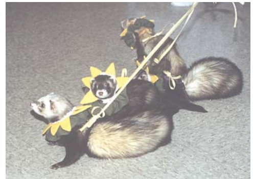
Irresistable ferrety daisies?! Too cute!

Kiss a Ferret Today . . . You'll be glad you did!