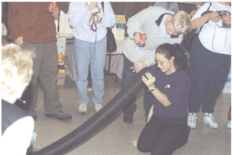
. . . or maybe not!

have hung in there and kept on going. How many fuzzy little lives you have helped to save. How many you have influenced and helped in so many ways.