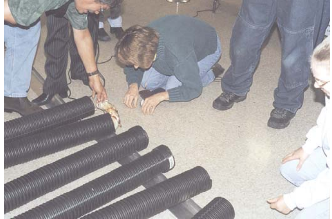
Must come out . . . eventually . . .