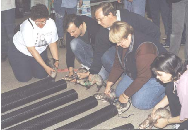
Whoever goes in . . .