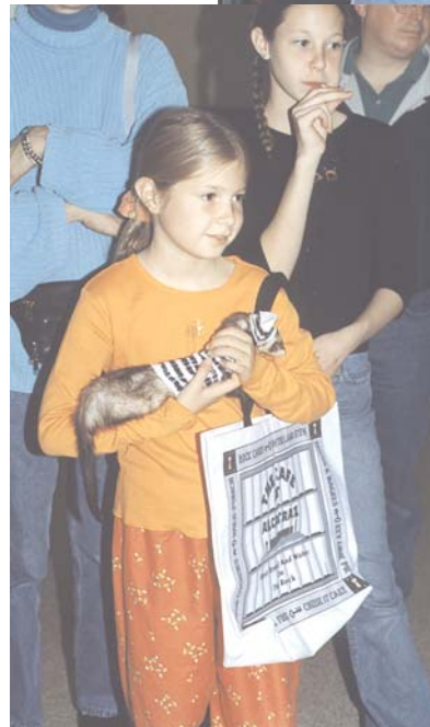
More ferrets . . . and more smiles.