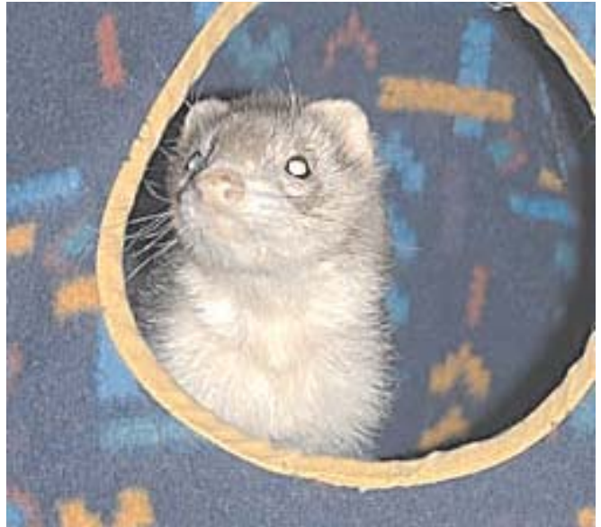
Hobo peeking out from the relative safety of a cozy ferret tent!

But with other ferrets, Hobo is a timid guy and feels most comfortable when out alone and in the company of the shelter folks. He will give kisses, enjoy surfing the ferret tube, go through the toy box picking out that "special" toy, and even climb into the laundry basket.