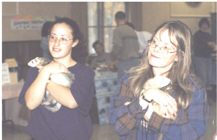
What is it about ferrets? Have you ever noticed how people who are holding a ferret do so — more often than not — with beatific smiles on their faces?