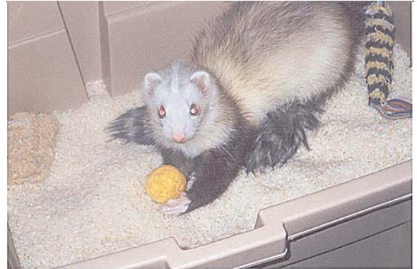
Tyler playing in his rice box of fun. Try this with YOUR ferrets!